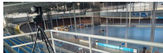
Figure 1. Panasonic AW-UE150 at the cycling track

position. Moreover, the size of the objects in the video frame can be controlled as well by adjusting the focal distance (zoom).